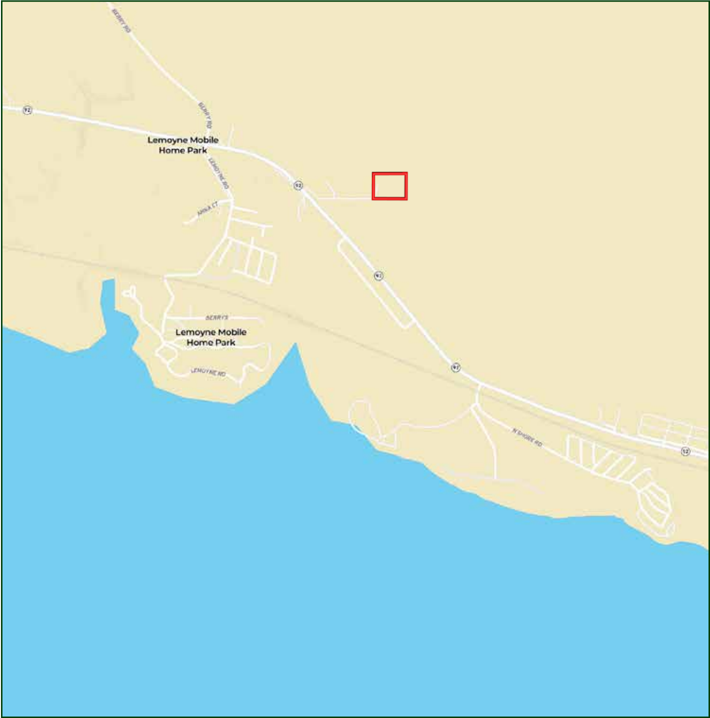
Boundary lines are estimates - Map for illustration only