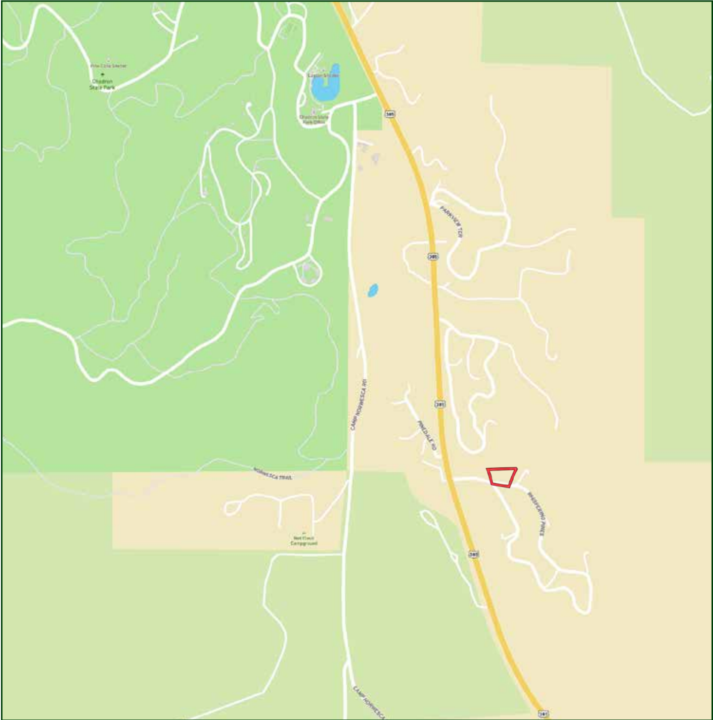
Boundary lines are estimates - Map for illustration only