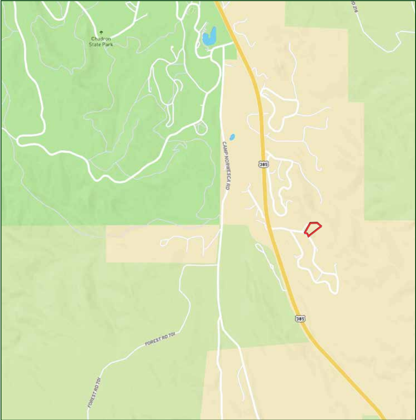
Boundary lines are estimates - Map for illustration only