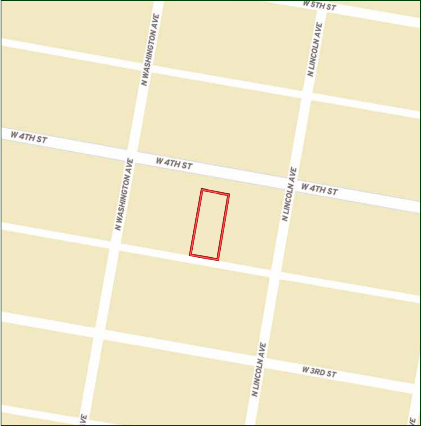
Boundary lines are estimates - Map for illustration only