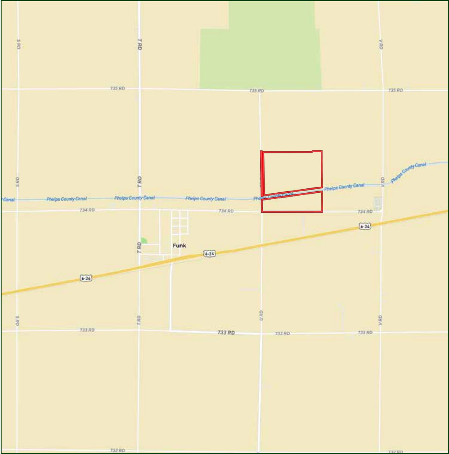
Boundary lines are estimates - Map for illustration only

LINDSEY FEUERBORN Sales Associate Cell Phone: 308-352-6377 Email: lindsey@lashleyland.com