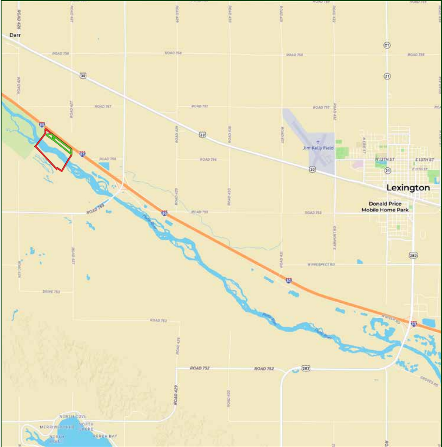
Boundary lines are estimates - Map for illustration only