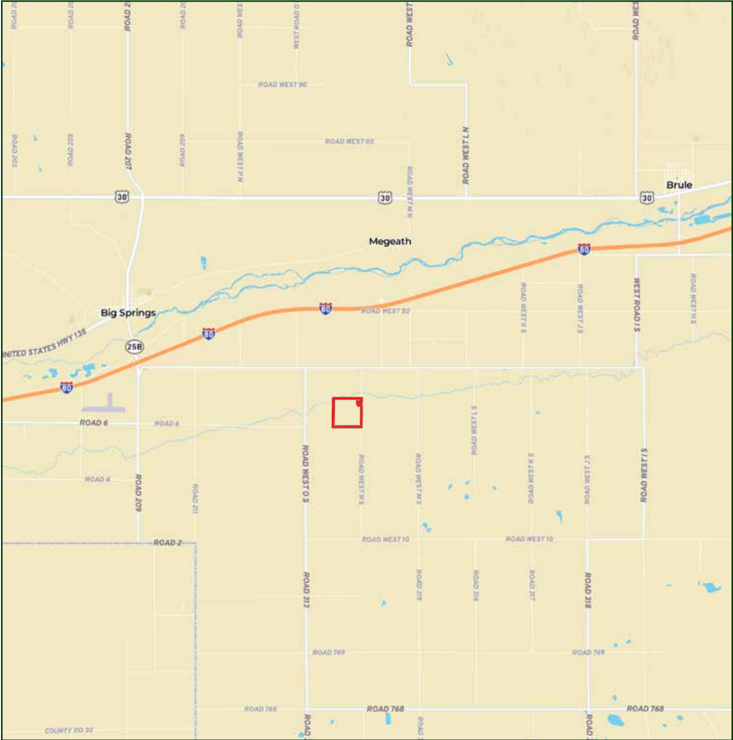
Boundary lines are estimates - Map for illustration only