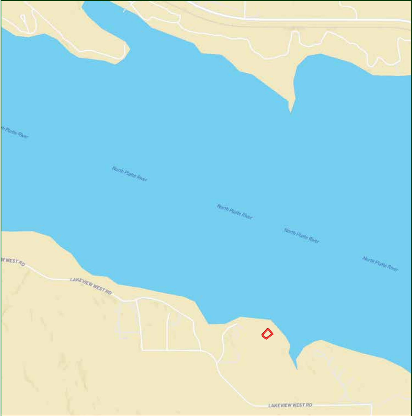
Boundary lines are estimates - Map for illustration only