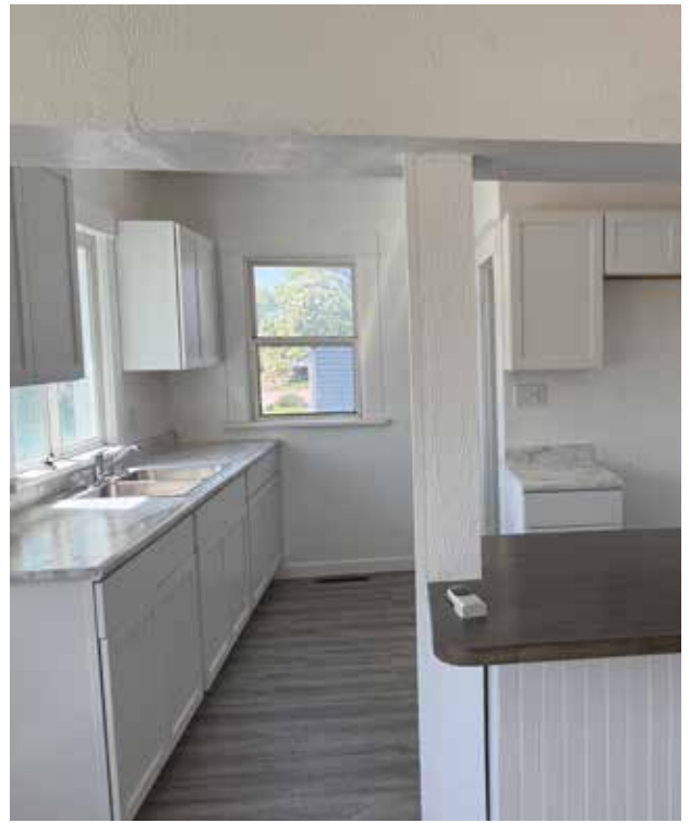
902 W. 8th