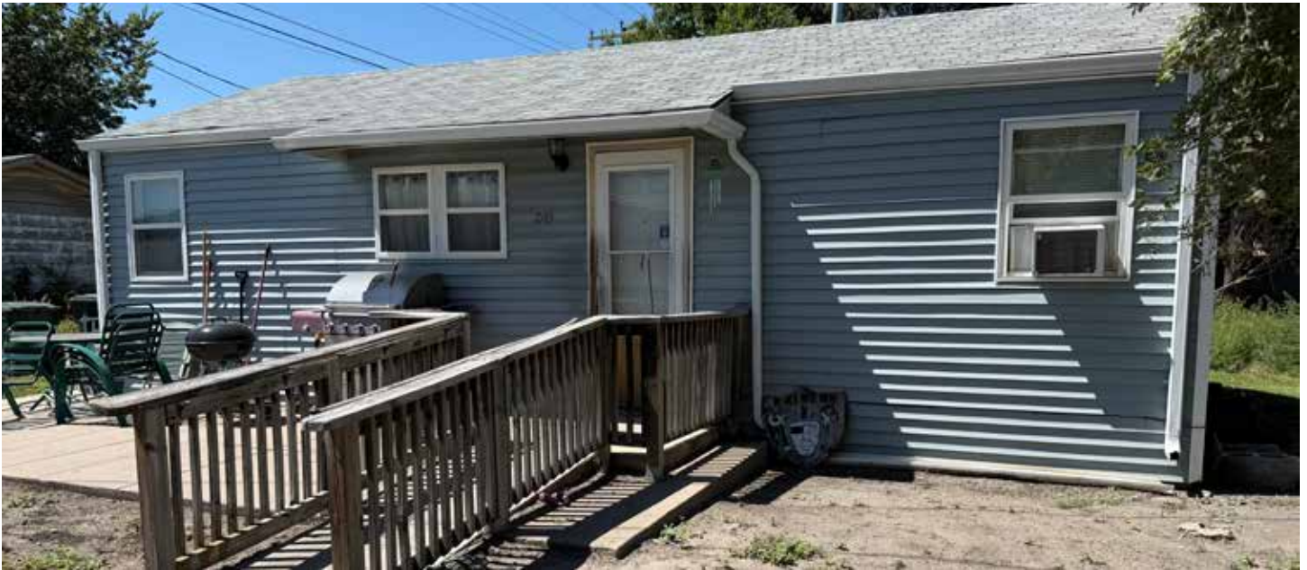
710 N. Jessie