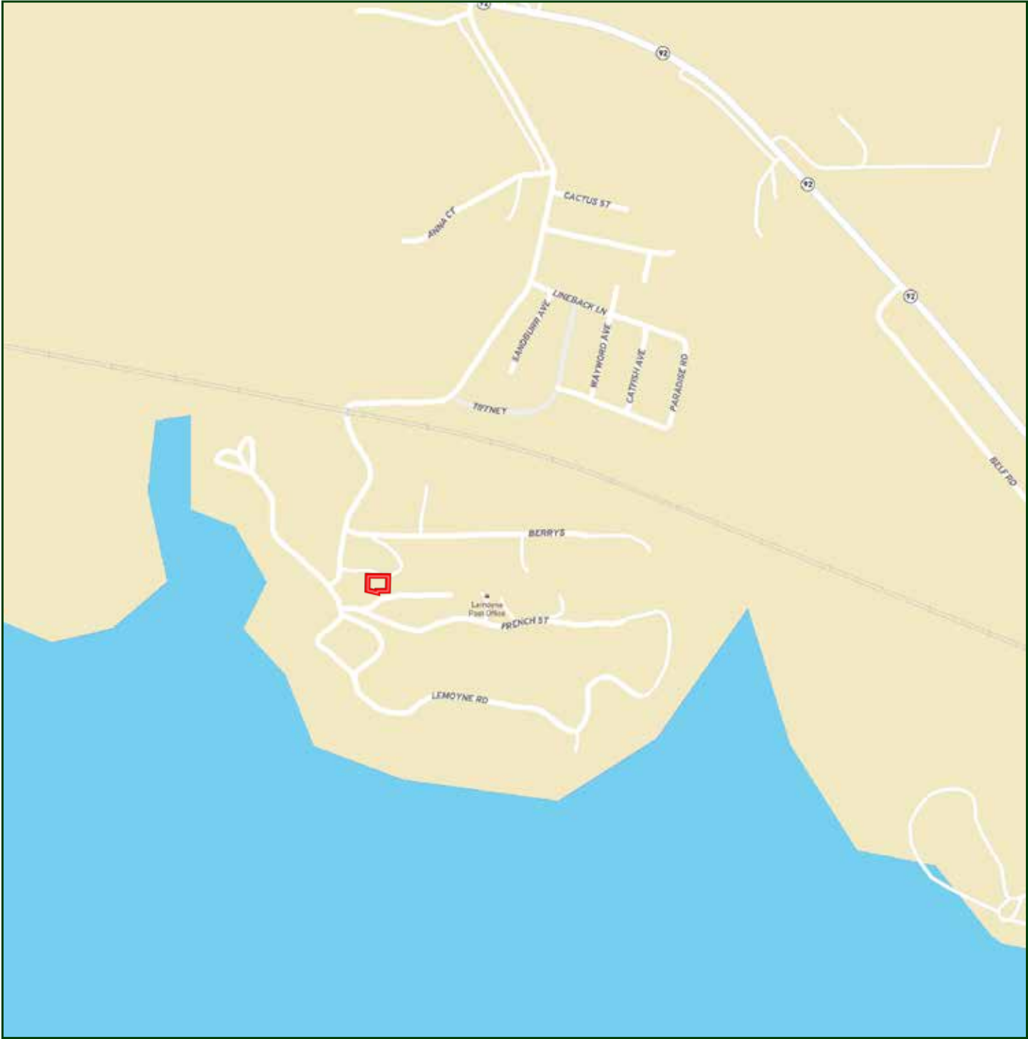
Boundary lines are estimates - Map for illustration only